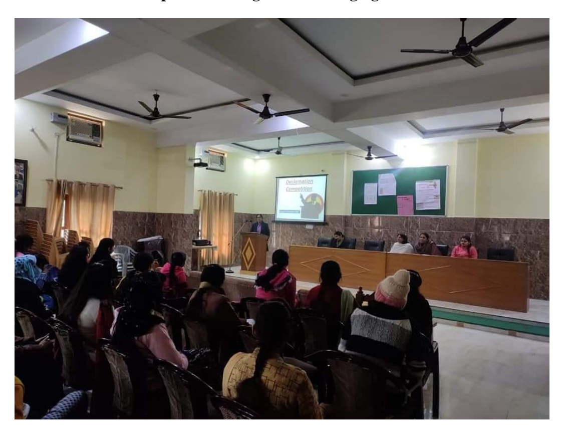
Distribution of Certificates